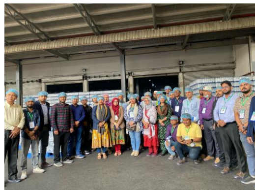
Glimpse of Field Visit with the Participants at Meghna Industrial Economic Zone as part of Training Activities